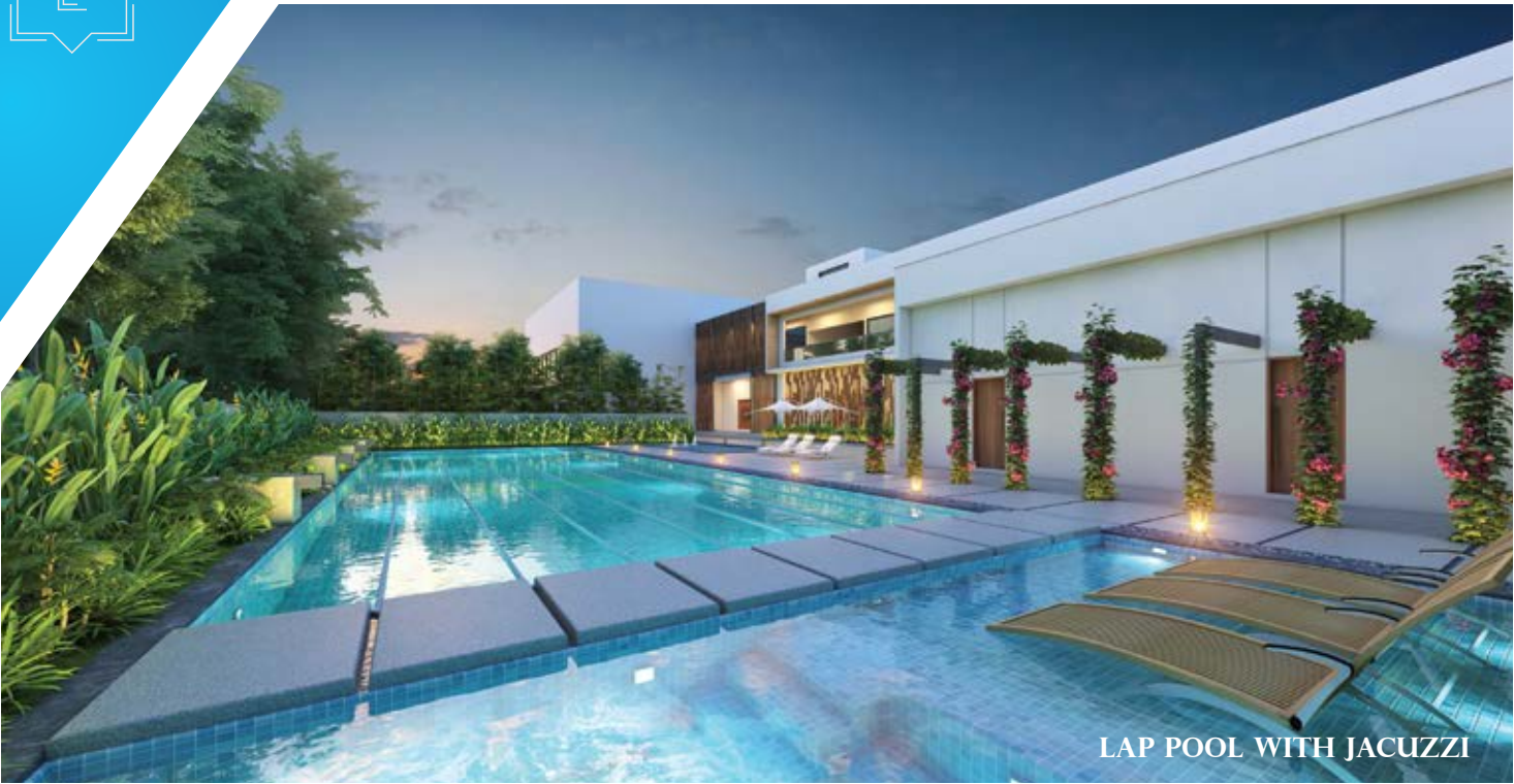
LAP POOL WITH JACUZZI